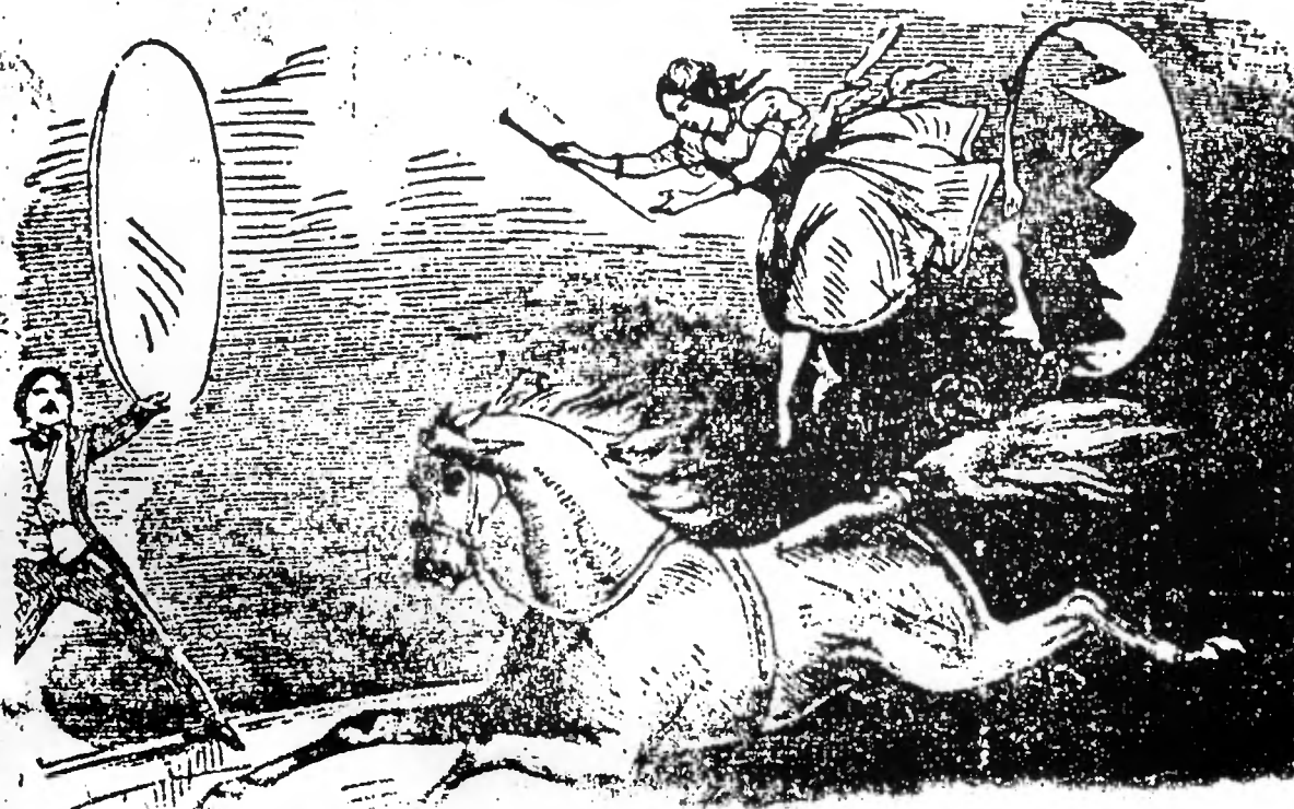
Fragment of a Poster, 3315